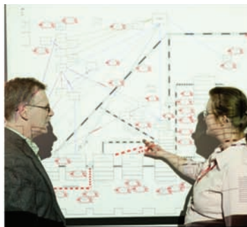
Enhancing Performance, Accountability, Quality