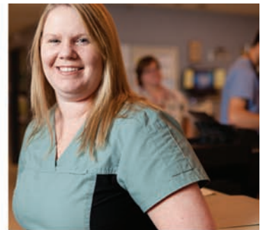
Enabling and Developing Our People