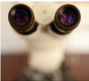
Advancing Research and Education