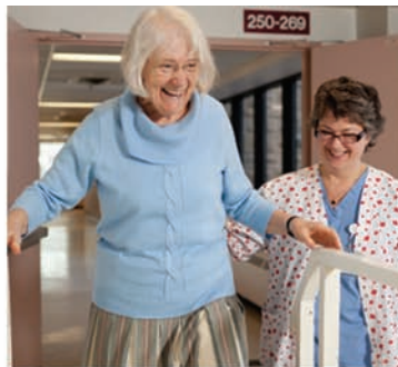
Excellent Experience, Excellent Care