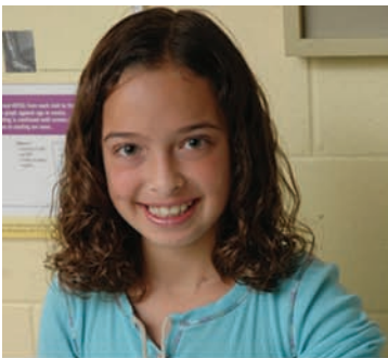
Defining What We Do